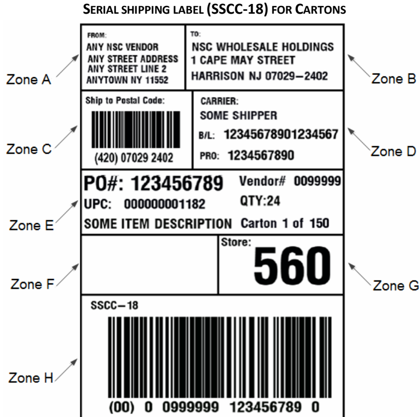
Label Information by Zone

All Shipping Labels are 4"x6" as per the GS1 Standards with black type on a white background.